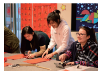
Chinese New Year Calligraphy Class