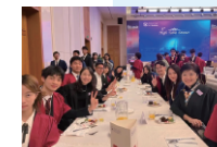
High Table Dinner