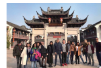
Visit the Nanguanxiang