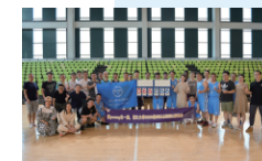
Zhejiang Major League Basketball Game