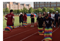
iMBA Fun Games